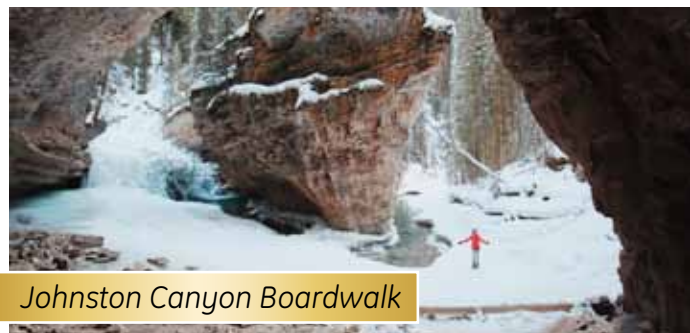
Johnston Canyon Boardwalk