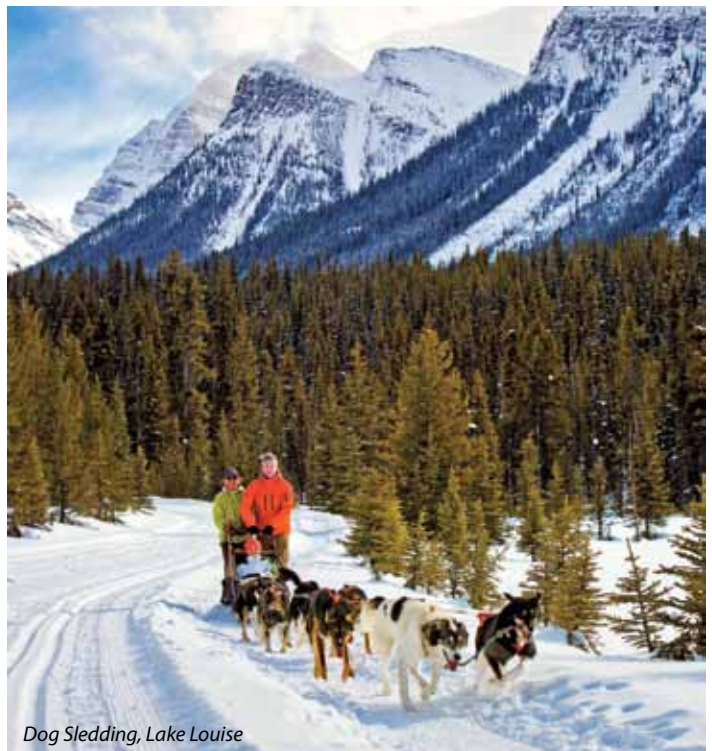
Dog Sledding, Lake Louise