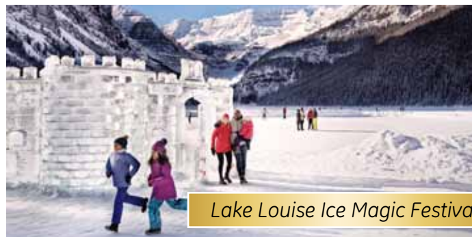
Lake Louise Ice Magic Festival