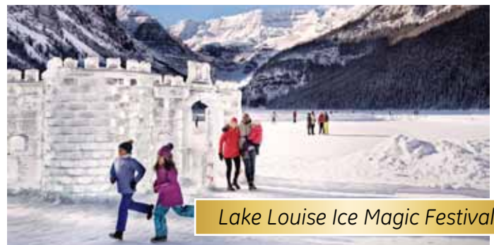
Lake Louise Ice Magic Festival