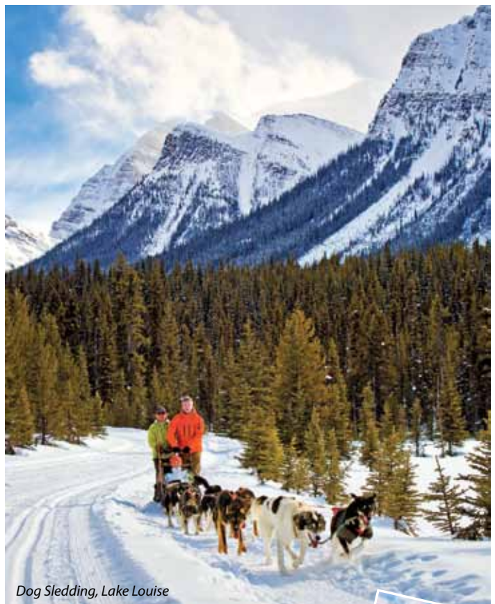
Dog Sledding, Lake Louise