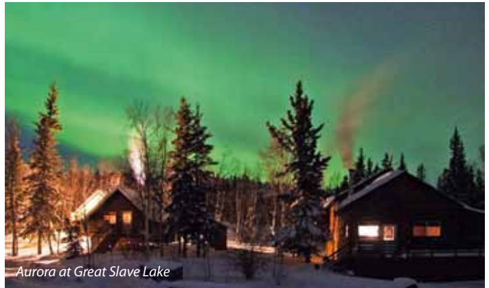
Aurora at Great Slave Lake