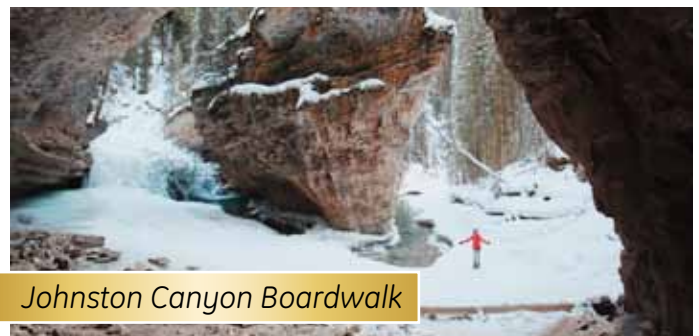
Johnston Canyon Boardwalk