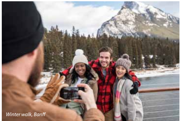
Winter walk, Banff

Not included: Flights – call us for best available airfares at time of booking, any meals, tours or services not listed as included.