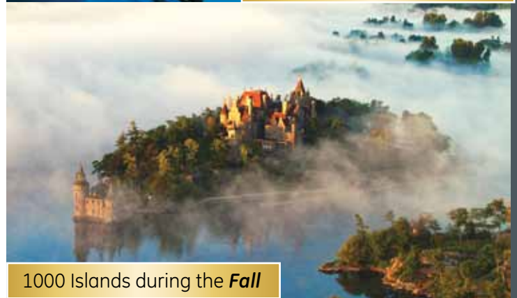
1000 Islands during the Fall