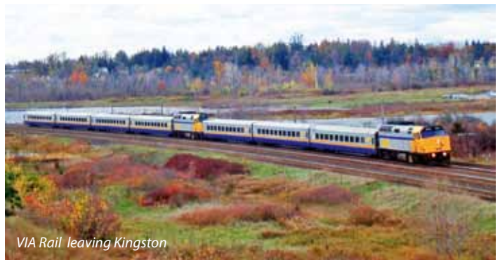
VIA Rail leaving Kingston