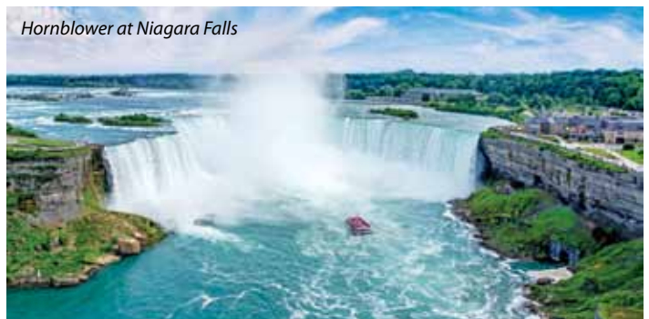
Hornblower at Niagara Falls