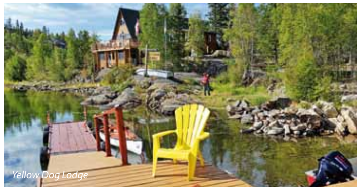
Yellow Dog Lodge