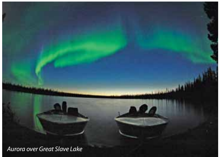
Aurora over Great Slave Lake

Includes: 10 nights accommodation, tours, transfers listed as included, Via Rail business class seating, return flights from Yellowknife to Yellow Dog Lodge. Private tour can be tailor made. Departs: Fall Colours & Aurora Viewing from Mid September to Mid October Aurora Viewing & East Coast touring departs from Mid August to Mid October.