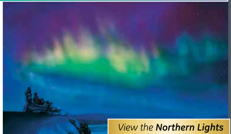
View the Northern Lights