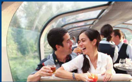
GoldLeaf Service Bi-level Dome Coach