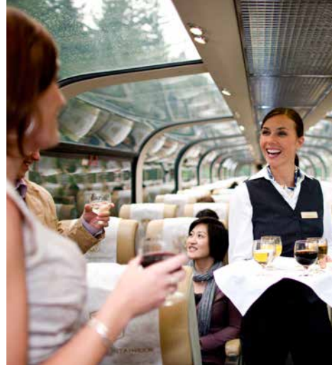
GoldLeaf Service Dome Coach