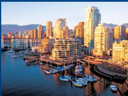
Vancouver, British Columbia, Canada

DISCOVER. RECHARGE. REPEAT. Now is the perfect time to discover the Pacific Northwest and the Canadian Rockies on the award-winning Rocky Mountaineer. When you book a qualifying* Rocky Mountaineer package by 2 May 2014, you can recharge with a FREE additional hotel night in Vancouver, Canada—or if your package includes our new Coastal Passage route between Seattle and Vancouver, receive a FREE additional hotel night in Seattle, USA, PLUS breakfast and dinner—a combined value of up to $750 per couple!