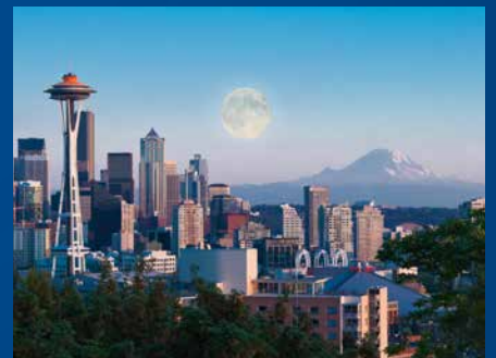
Seattle, Washington, USA