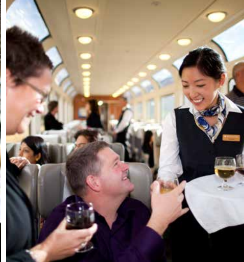
SilverLeaf Service Dome Coach