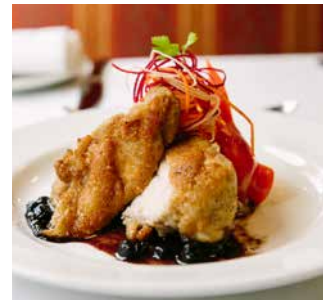
GoldLeaf Service Cuisine

hotel night in Vancouver— OR —if your qualifying package includes Rocky Mountaineer's newest route, Coastal Passage between Seattle and Vancouver, receive a FREE additional hotel night in Seattle PLUS a dinner and breakfast at your hotel!